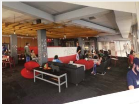
A mock-up of the new open community space at Geekdom, once it moves into the historic Rand building.

Converting a historic building into a modern-day tech coworking space to incubate hot new startups in downtown San Antonio isn't an easy task. But Irby Hightower of Alamo Architects and his team have managed to do just that. They took a former bank building and are transforming the seventh floor into a modern day workplace for geeks.