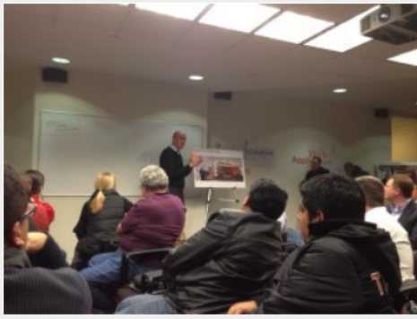
A packed house turned out for the town hall meeting at Geekdom to unveil the new design for the site at the Rand building.

“We think that’s the right approach,” Hightower said. “The ceilings will have more character...It’s the kind of space you can experiment in and have more fun in.”